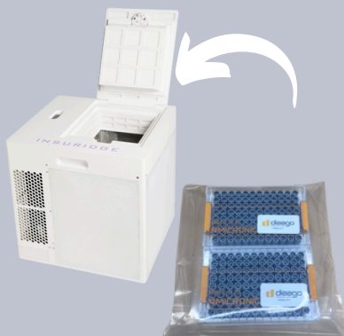
Cryo Storage SKU: INV-001

Provides advanced temperature-controlled shipping with a long-lasting battery, maintaining -10 to 25°C for over 100 hours. With integrated LTE connectivity and an easy-to-use app, it's perfect for secure, long-duration sample transport. Order now and receive a pack of Micronic 96-2 racks included—ideal for optimizing your sample storage. Only 40 lbs!