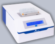
SPL Guard Arizona SKU: G20620